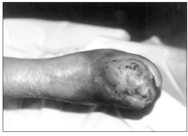
Fig 2. Healed ulcer after herbal treatment and skin grafting

Note that in spite of the loss of toes, the foot retained the middle portion and weight-bearing ability